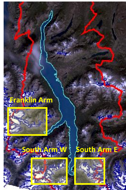
Figure 2. Time series of glacier extent for three areas in the Chilko watershed, estimated from LANDSAT, for Franklin Arm, South Arm West, and South Arm East glaciers.